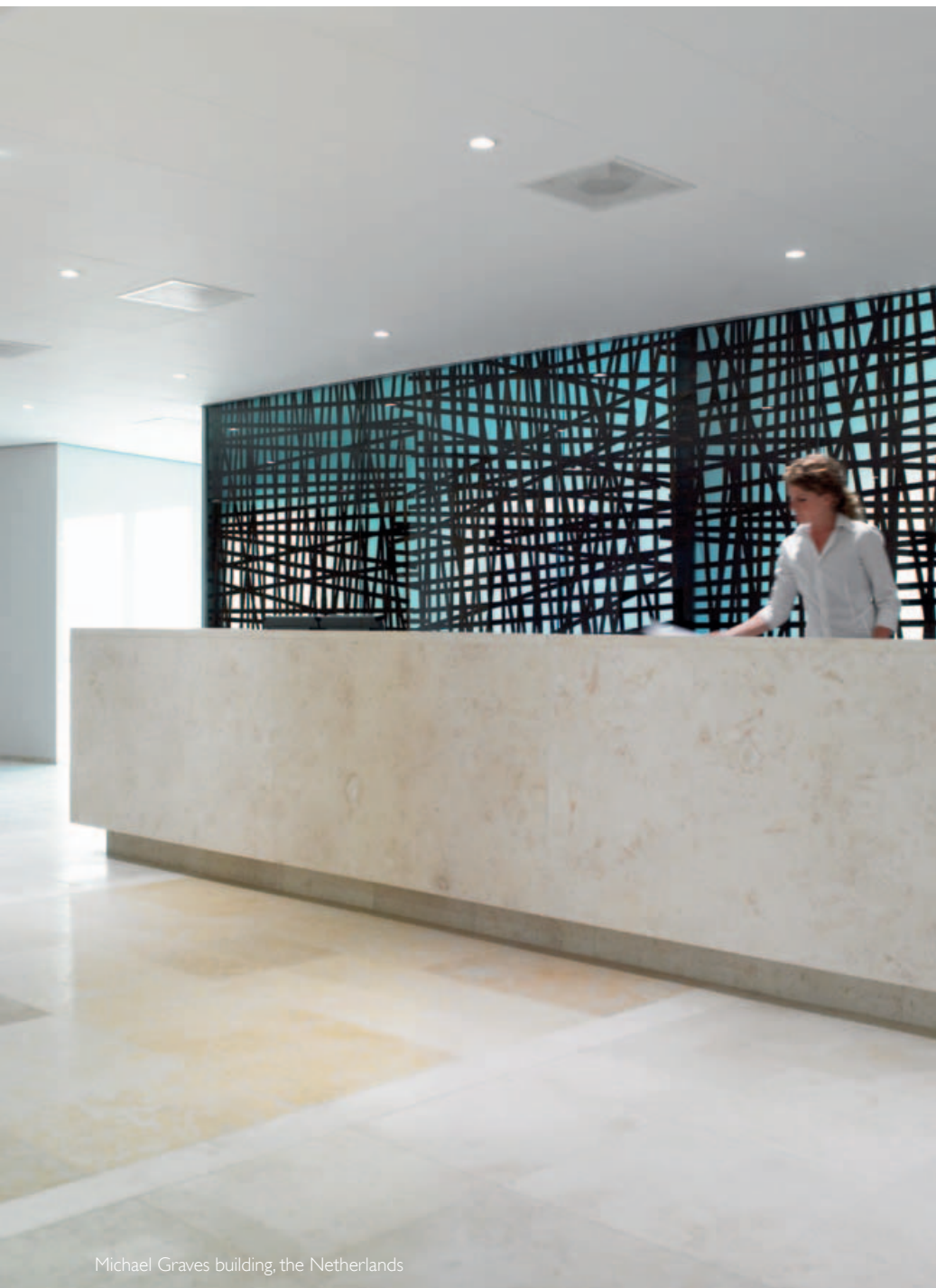
Michael Graves building, the Netherlands