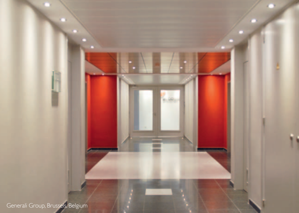
Generali Group, Brussels, Belgium