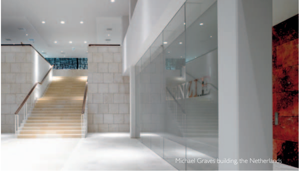
Michael Graves building the Netherlands