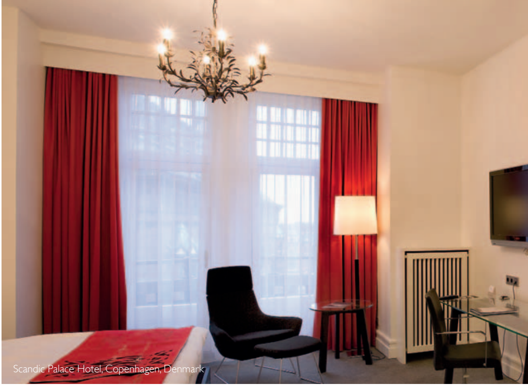
Scandic Palace Hotel, Copenhagen, Denmark